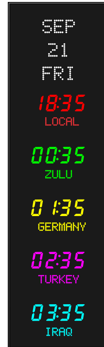
Model 3611I - 2.5" time, 1.2" zone labels, 2.0" date, 5 zones

Construction: Black anodized Aluminum frame with plexiglass front lens. Mounting hardware included.